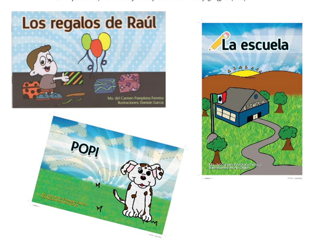
Fig. 1. Example of the cover page of three coloring books of the Audiovisual material for providing visual information to each song.